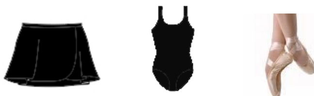
Black leotard & skirt