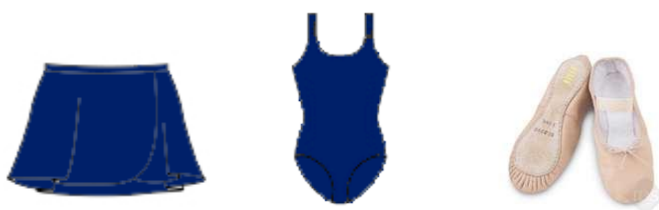
Navy skirt, leotard & Ballet shoes