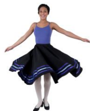
Character Skirt & Shoes